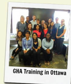
GHA Training in Ottawa

Recently, as part of my role as UBC's Global Health Advocate (GHA), I participated in a training weekend in Ottawa, Ontario, along with other medical students from across Canada. We had the opportunity to connect with leaders in the global health field and learn how to improve our advocacy skills, especially surrounding issues of injustice within healthcare. Going into Ottawa, I wasn't quite sure what to expect... Click to continue reading