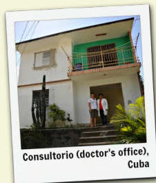
Consultorio (doctor's office), Cuba